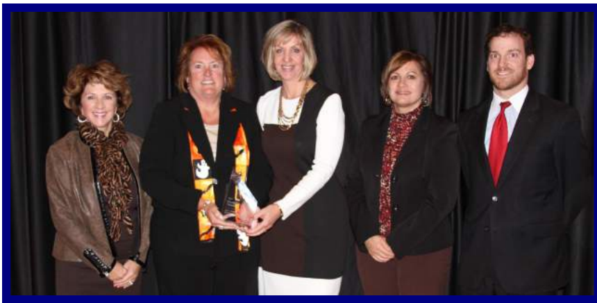
Sky Ridge Medical Center Lone Tree, CO Foothills Level