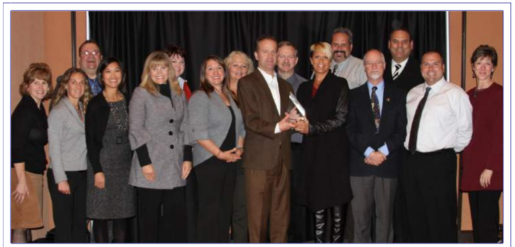
Donor Alliance Denver, CO Foothills Level