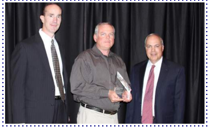
RTD FasTracks Denver, CO Timberline Level