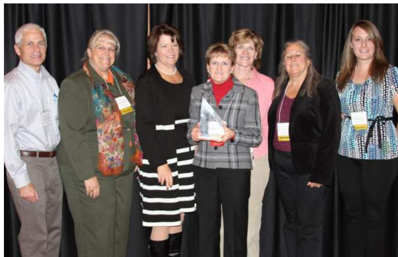
Littleton Adventist Hospital Littleton, CO Foothills Level