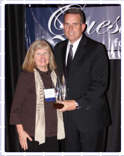
Poudre Valley Health System Fort Collins and Loveland, CO Peak Level