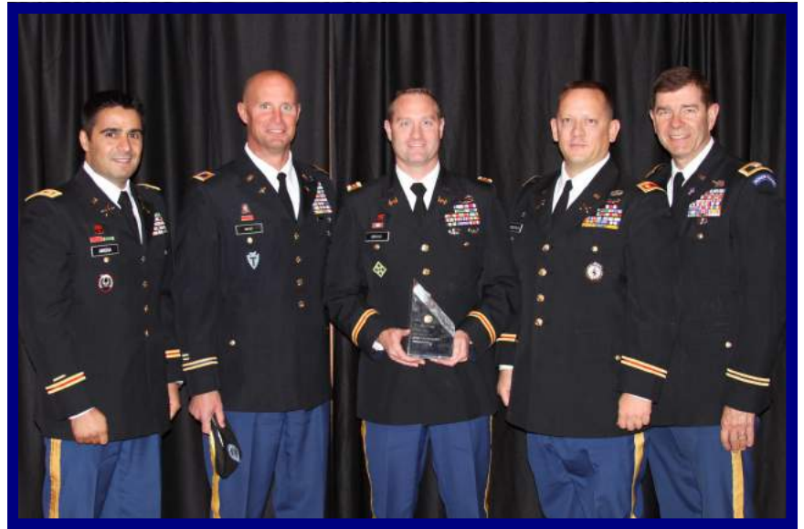
Colorado Army National Guard Denver, CO Foothills Level