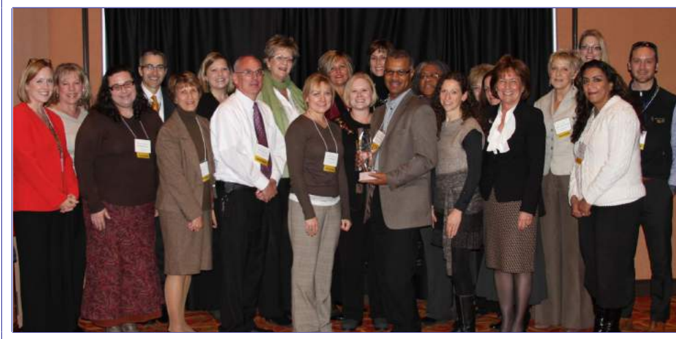
Denver Health Denver, CO Peak Level